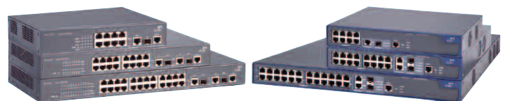
left, from top: 3Com Switch 4210 9-Port, Switch 4210 18-Port, Switch 4210 26-Port right, from top: Switch 4210 PWR 9-Port, Switch 4210 PWR 18-Port, Switch 4210 PWR 26-Port

Industry-standard IEEE 802.3af Power over Ethernet is supported on three switches: the 9-, 18- and 26-port PWR models. These switches are ideal for workgroups where phones or wireless access points connect together with user end stations, reducing costs and simplifying the installation of converged voice and wireless networks by providing power over the same Ethernet cabling as used for data.